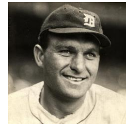
Heinie Manush- Mr Clutch

In the 11 th with 2 outs and a runner on 2 nd Heinie Manush delivered again with a game winning rbi single.