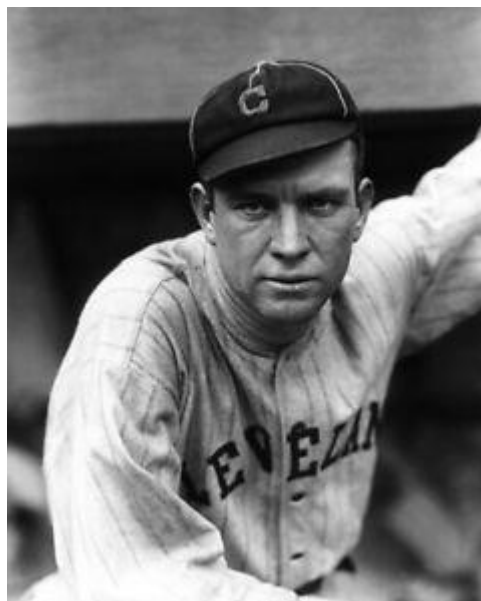
Tris Speaker- Did not get voted Mr Congeniality in High School.

Tris Speaker has been in the SCL since its inception in 1910, and he has manned centerfield for the Peoria Caterpillars for his entire career. He has a .328 lifetime average and is closing in on 600 career doubles. He is a 2x Honus Wagner Award winner. (1913, 1916) He has led the league in hitting 2x, hitting .368 in 1913, and .380 in 1916. He is 12x All-Star and along with Gavy Cravath they are the only players with at least 1-double, triple and Home Run in the All-Star game.